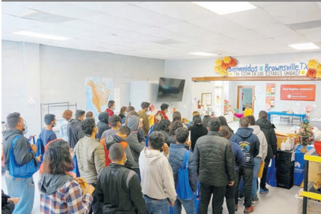
People line up inside the migrant welcome center across from the bus station in Brownsville, Texas, on Friday, Dec. 16, 2022.